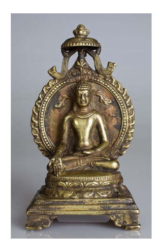
Ratnasambhava India, Pala dynasty (750-1174), 9th century Copper alloy, height 15 cm Carlo Cristi

A collection of Kashmiri-style early illuminated manuscripts from West Tibet will be on view in Carlo Cristi's exhibition, which will also include bronzes, thangkas and ritual objects. Additionally, a very large samite weave textile with a bird in a roundel holding a grape in its beak is of particular interest. (9–16 March; Leslie Feely Fine Art, 33 E 68th St, 5th Floor)