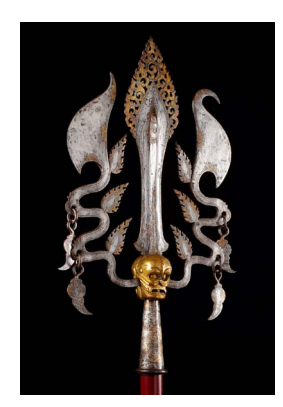
Votive trident Tibet, 18th–19th century Steel with applied gold, length 43 cm Runjeet Singh

Debuting in New York is Runjeet Singh , with a selection of arms and armour. Highlights are a 17th-18th century bejewelled 'Khanjar' dagger in nephrite with cabochon rubies and emeralds, a steel blade and a wood scabbard with matching jade mounts; and an 18th–19th century votive trident from Tibet, in steel with applied gold. (9-15 March; Tambaran Gallery, 5 East 82nd St, Lower Level)