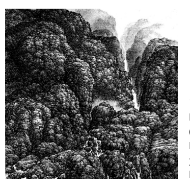
Waterfalls By Hsia I-fu, (c. 1920–2016), 2001 Ink on xuan paper, 33.5 x 34 cm M. Sutherland Fine Arts

Contemporary Chinese art specialists M. Sutherland Fine Arts will be exhibiting works by Yang Mian, Hsia I-fu, Hung Hsien, Hsu Kuohuang and others in their show 'Guo Hua: Defining Contemporary Chinese Painting'. The exhibition will explore what makes a work an example of quo hua (lit., 'national painting')—whether the media, the technique, the location or the artist's ethnicity. (9–18 March; 7 East 74th St, 3rd Floor)