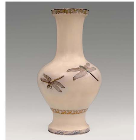
Orientations Gallery Hattori Tadasaburo of Nagoya, late Meiji period, cloisonné enamel vase depicting dragonflies, height 35.5 cm

art activities.” The galleries and auction houses will present a spectacular array of treasures, including the rarest and finest examples of ceramics, jewellery, textiles, paintings, sculpture and bronzes from different Asian countries dating from 2000 years BC to the present. I wish all the participating dealers and auction houses great success, and I hope this is the beginning of a return to normalcy for the Asian art world. I am delighted to illustrate some of the highlights in this Editorial.