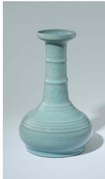
Marchant Kawase Shinobu (born 1950), celadon vase

The Master of the Water, Pine and Stone Retreat (born 1943), No Two Aspects of Wisdom Are Ever the Same , Hong Kong, Winter 2017, ink and watercolour on Arches paper, 52 x 57 cm