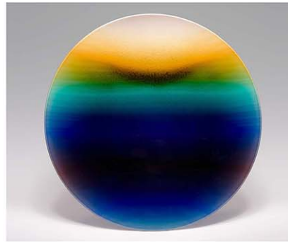
Oriental Treasure Box Tokuda Yasokichi III (1933–2009), Reimei (Dawn) , Kutani porcelain charger