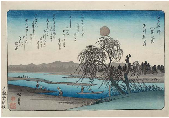
Sebastian Izzard LLC Asian Art Utagawa Hiroshige, Autumn Moon on the Tama River , 1837/1838, colour woodblock print, 26 x 37.8 cm