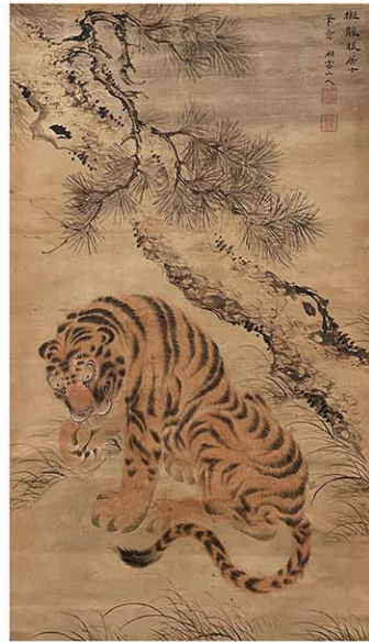
Kaikodo Tachibana Shōun (active early 19th century), Tiger in Landscape , hanging scroll, ink and colour on paper, 169 x 94.8 cm