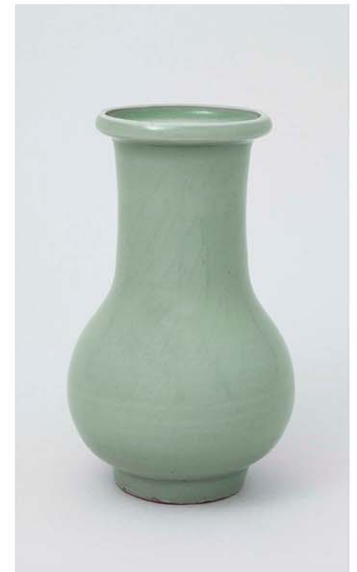
Zetterquist Galleries Longquan vase, Southern Song dynasty

signature pinched flower vases. Perhaps some of the most remarkable of his works are the series of exceptionally fine ewers, the vision clearly derived from bronze and ceramic bottle vases of the Sui and Tang dynasties. His love of nature, combined with ethereal celadon tonal glazes and flawless technique, makes his ceramic art a joy to see and handle, with a feeling of movement apparent in each object.